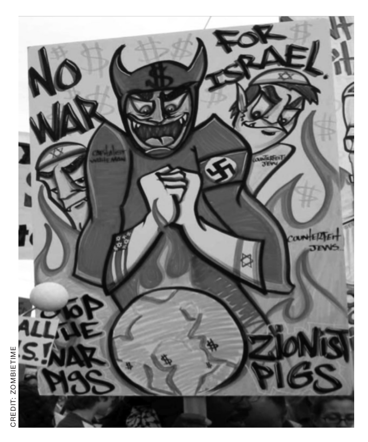
Antichrist of the Left: San Francisco "Anti-War" Rally, 2003.

By the time the collective voice of global morality, in the tens of millions world-wide, protested Bush's war in 2003, the image of the GPL's Antichrist had taken shape: a combination of Nazism, Capitalism, US Imperialism, and Zionism.