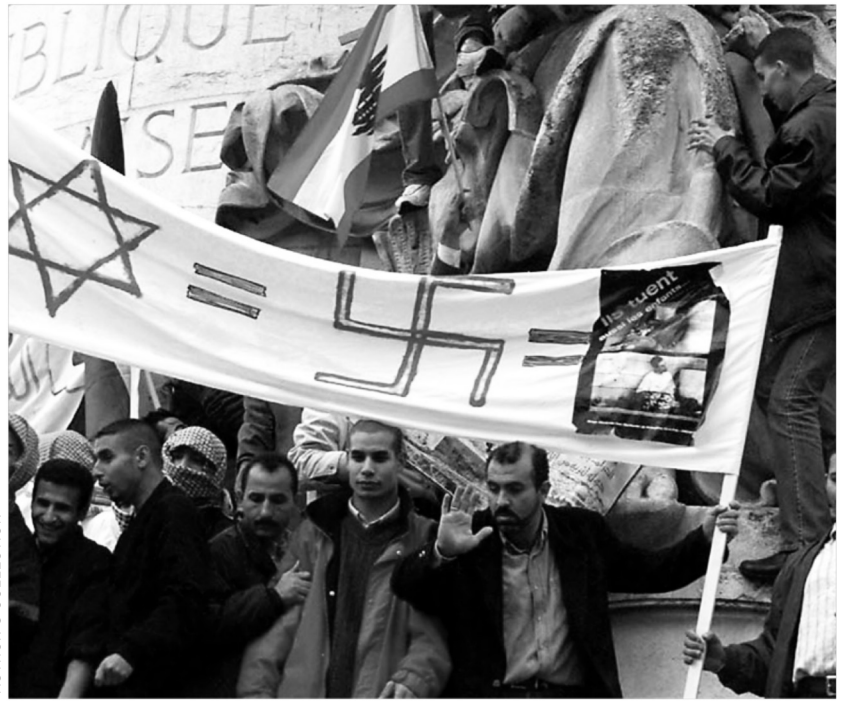
Paris: Place de Republique, October 6, 2000.

Were one to use the language of medieval religious movements, "le petit Mohamed," as the French call him, was the patron saint of a secular replacement theology in which Israel became the new Nazis (for post-war Westerners, the embodiment of evil), and the Palestinians the new Jews. Nor did such extravagant symbolic rhetoric remain on the fringes. Catherine Nay, respected Europe 1 news anchor, spelled out the meaning of that graphic: "This death," she intoned "replaces, erases, the picture of the boy in the Warsaw Ghetto." Thus the image of a child reportedly killed in a war zone replaced an image that symbolized the deliberate murder of one million children. Despite the staggering disorientation involved in such a moral judgment, Nay spoke for many.<sup>487</sup>